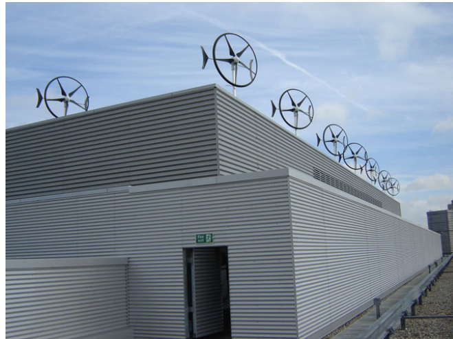
Rooftop wind turbines.

A number of rooftop wind turbine products have been developed and are now available on the Australian market. These can be installed on top of roof structures or a free-standing wind turbine on ground level sites nearby your power demand. Features of these include low noise, or 'silent' operation, as well as low start up wind speeds and low vibration. Generally, the energy production from building-mounted wind turbines is not as great as for pole-mounted systems of the same height, due to the turbulence caused by buildings.